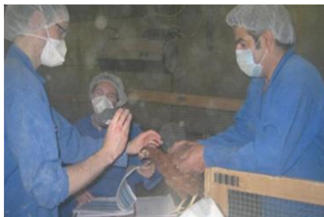
Picture 2: Research in a floor housing breeding project. Selection of young pullets.

Taken together, the chances for success of a small scale breeding program for commercial egg production are limited.