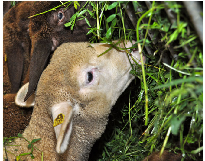
Sainfoin is a highly palatable legume for small ruminants.

Another health effect on ruminants consuming sainfoin has for long been identified, i.e. the prevention of bloating (in contrast with clover). This positive effect has been associated with the presence of condensed tannins and probably explains, why the literal translation of the French word "Sainfoin" means "Healthy Hay".