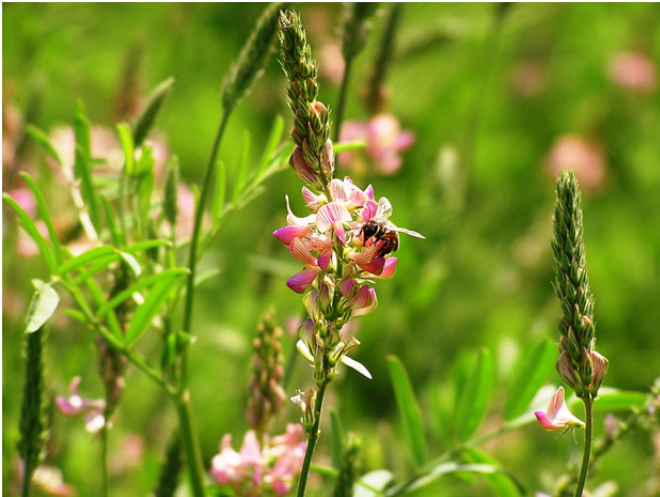
Sainfoin is an attractive feed for bees.